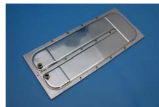
Figure 1. LCP with flexible heat transfer surface.

The fluid dynamics in the channel where the heat transfer takes place is pure laminar. The meso-sized channels has an equivalent diameter of 0,8 mm. The flow path starts at the inlet channel in the middle that feeds the meso-channels, between the IGBT's base plates, with a parallel flow and further to the outlet channel in the peripheries.